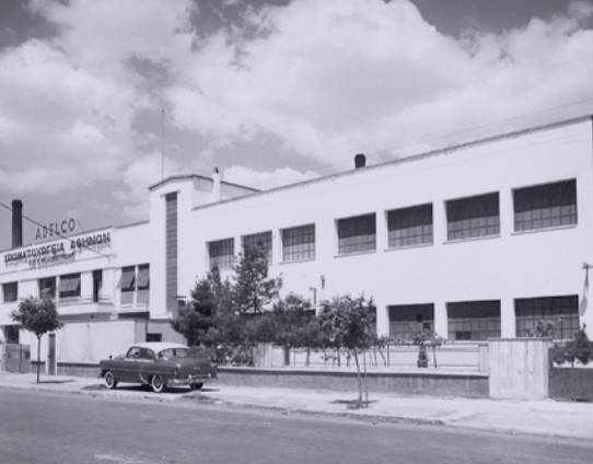
Photographs from 1950